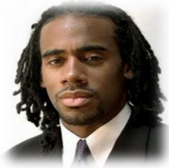
Locks should be kept neat

Whether you are a male or female, you should ensure that you maintain proper body hygiene at all times. In addition, if you have any tattoos or other body piercings, ensure that they are covered as best as possible. Only head covers that are worn for religious purposes are permitted.