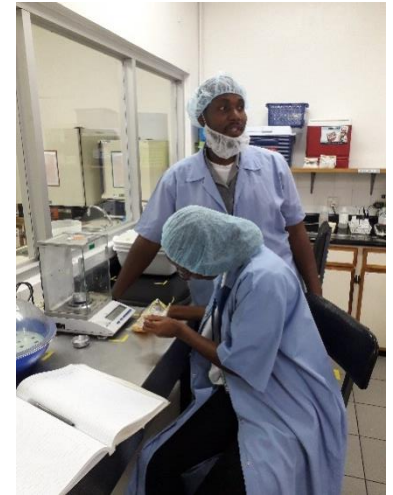
Co-op Ed student (seated) at work.