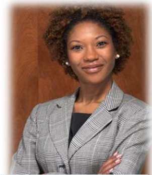
Dress for success