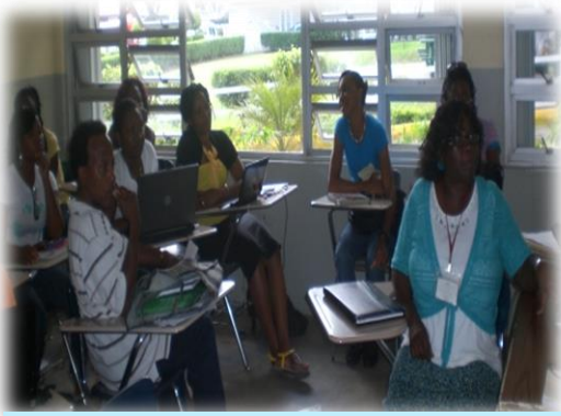
Students participating in an Awareness sessions

Prior to student engagement, the University is expected to: