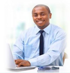
Dress for success