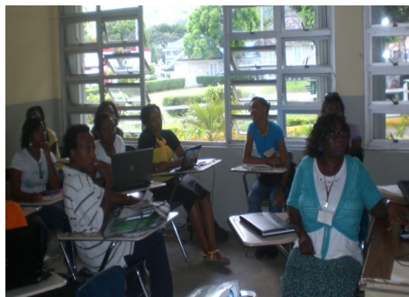
Students participating in a Co-op Ed Awareness Session