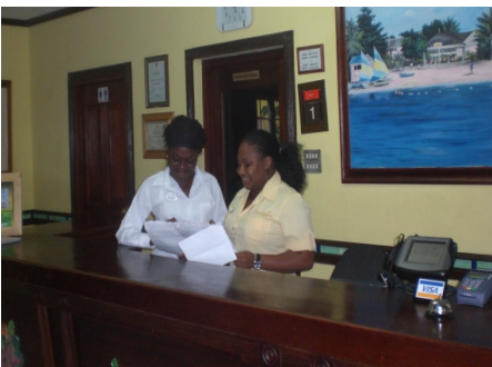
Tourism and Hospitality student performing front desk duties

Coming out of this Conference, the resolve of the University’s Co-op Ed Unit has been to intensify its search for international Co-op Ed exchange partnerships with a view to increasing the employment competitiveness of our graduates. We invite dialogue from our stakeholders in this regard.