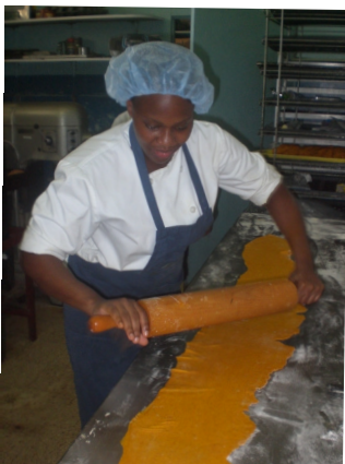
Student enrolled in BEd. Food Service Production programme on Co-op Ed assignment