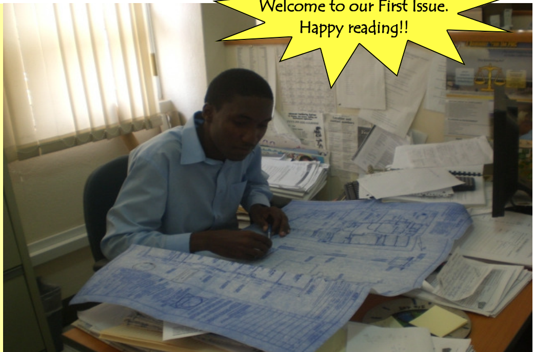
Co-op Ed Student (Industrial Technology major) at work