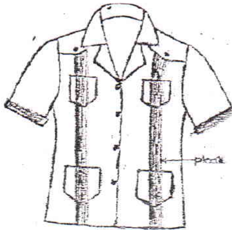
Beige Bush Jacket (front)