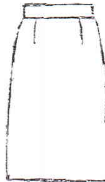
Brown Skirt (front)