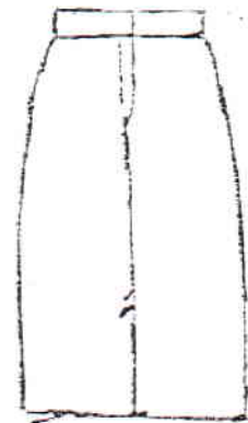
Brown Skirt (back)