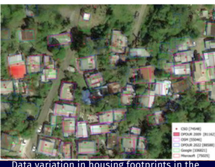
Data variation in housing footprints in the community of Bises, Castries District, Saint

HIT RESET is implemented by UWI in partnership with CDEMA and AdeKUS. HIT RESET provides support for projects that develop innovations to increase resilience in coastal communities of the Caribbean and strengthens institutions', national and local governments' ability to leverage information and knowledge for policy amendments.